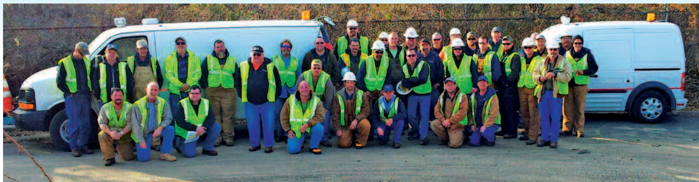
A group of Local 1393 members at Vectren Energy mobilized to assist recovery when Hurricane Sandy struck.

The devastating impact of Superstorm Sandy has at this writing mobilized our brothers and sis-