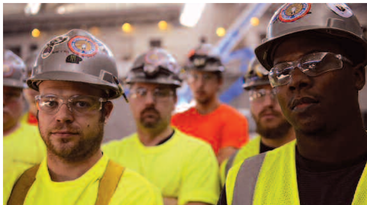
Despite the worst economic crash in decades, the IBEW regained its pre-recession market share last year.