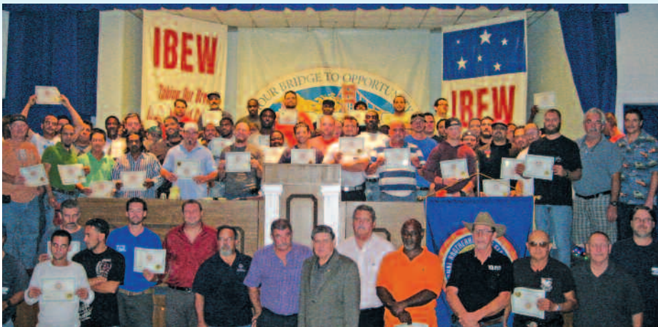
Some of the Local 349 members who volunteered their help during the 2012 election season.

Brotherhood. Take pride in your work and pride in yourself. The work we do is a reflection of ourselves and our union. Teach and lead by example. We are the union. Make those who came before us proud.