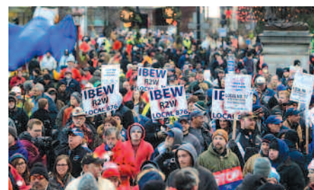
IBEW members from Locals 17 and 876 hold up placards at a union-wide rally in Michigan.