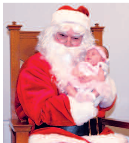
A new addition to the IBEW Local 617 family attends holiday party.